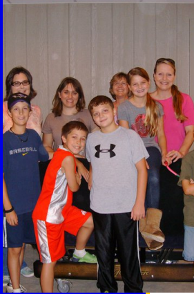
Children's Mission Trip

It is amazing to sense our deepening relationship with folks in our community as we simply reach out in hospitality!